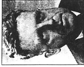
Alfred Charles Kinsey (1894-1956)

"In 1961 Illinois changed its laws to conform to the Model Penal Code. Other States soon followed . . . The sweeping references by Chief Justice Burger to the history of Western civilization and to Judeo-Christian moral and ethical standards did not take account of other authorities pointing in an opposite direction. A committee advising the British Parliament recommended in 1957 repeal of laws punishing homosexual conduct. The Wolfenden Report . . . Parliament enacted the substance of those recommendations 10 years later." [Emphasis added.]